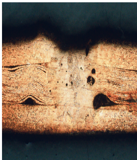
1 Laser-beam microwelding of electrode stacks with a wavelength of 1070 nm. 2 Cross-section of the contacting of the copper foils to the arrester tab.