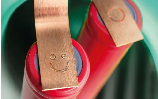
Image 1: In battery technology, lasers already enable precise and stable connections today: Laser bonding can be used, for example, to weld copper ribbons onto battery cells.

FRAUNHOFER INSTITUTE FOR LASER TECHNOLOGY ILT