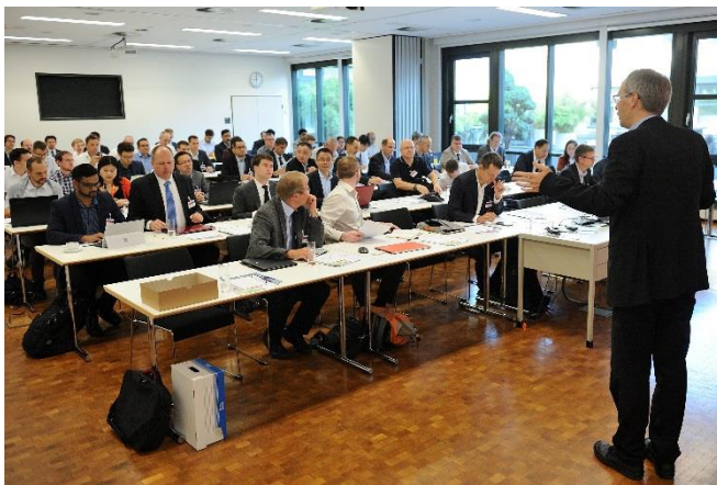
Image 1: Sharing research results at the "3 rd Conference on Laser Polishing – LaP 2018" in Aachen.