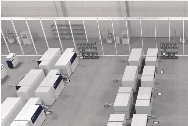
Picture 1: Additive Manufacturing factory design of the future.