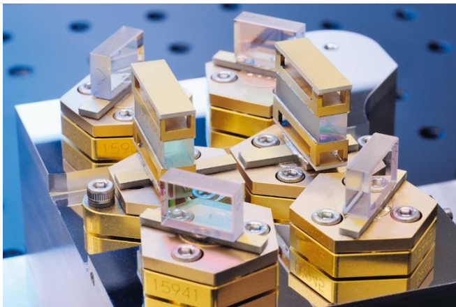
Image 2: Optical parametric oscillator (OPO) for the MERLIN-LIDAR system, based on FULAS, the new Future Laser System from Fraunhofer ILT.