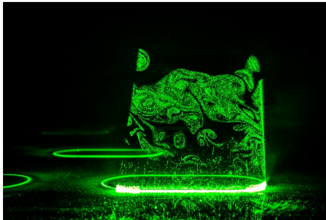
Picture 2: Structuring process by direct ablation with ultrashort pulse laser radiation.

The Fraunhofer-Gesellschaft is the leading organization for applied research in Europe. Its research activities are conducted by 69 institutes and research units at locations throughout Germany. The Fraunhofer-Gesellschaft employs a staff of 24,500, who work with an annual research budget totaling 2.1 billion euros. Of this sum, 1.9 billion euros is generated through contract research. More than 70 percent of the Fraunhofer-Gesellschaft's contract research revenue is derived from contracts with industry and from publicly financed research projects. International collaborations with excellent research partners and innovative companies around the world ensure direct access to regions of the greatest importance to present and future scientific progress and economic development.