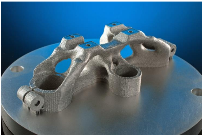
Picture 2: Demonstrator for a topology-optimized motorcycle triple clamp (material: AZ91).

The Fraunhofer-Gesellschaft is the leading organization for applied research in Europe. Its research activities are conducted by 67 institutes and research units at locations throughout Germany. The Fraunhofer-Gesellschaft employs a staff of nearly 24,000, who work with an annual research budget totaling more than 2.1 billion euros. Of this sum, around 1.8 billion euros is generated through contract research. More than 70 percent of the Fraunhofer-Gesellschaft's contract research revenue is derived from contracts with industry and from publicly financed research projects. International collaborations with excellent research partners and innovative companies around the world ensure direct access to regions of the greatest importance to present and future scientific progress and economic development.