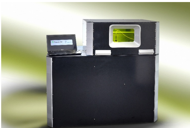
Picture 1: Debut at formnext 2016: the new, low-cost SLM unit for 3D printing of stainless steel components is particularly suitable for entry-level users.

At formnext in Frankfurt am Main from November 15-18, 2016, prospective buyers can visit the Fraunhofer booth to see the new, low-cost SLM unit in action: Hall 3.1, Booth E60.