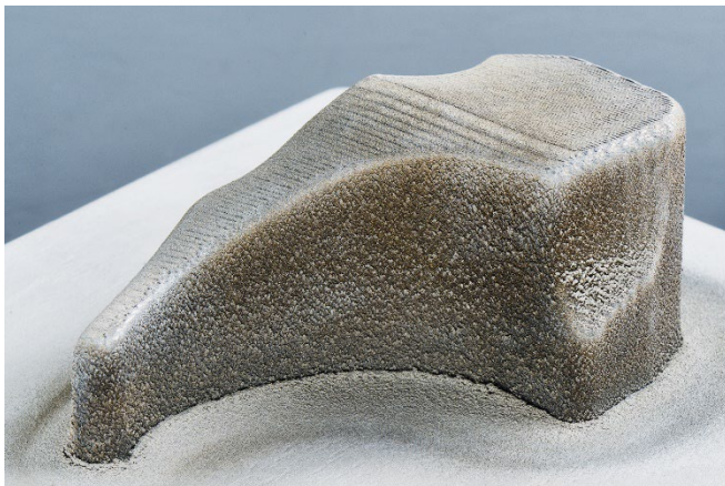
Image 4: Fast and precise: Using the example of a molded part additively manufactured with EHLA 3D, the institute demonstrated that it could significantly reduce printing time compared to LMD and LPBF.